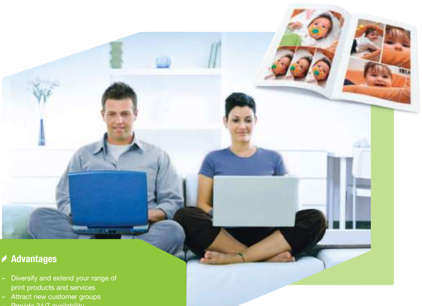
Photo book creation is an easy and attractive enhancement of your online print offering. Via a photo book application, you provide your customers with easy yet extensive online layout possibilities to create albums or calendars with their photos of holidays, events and other occasions. Similar to other web-to-print applications, photo book software includes online submission, payment and tracking, right down to the final delivery or collection of the printed photo book.

“Expand your services and grow your revenue.”