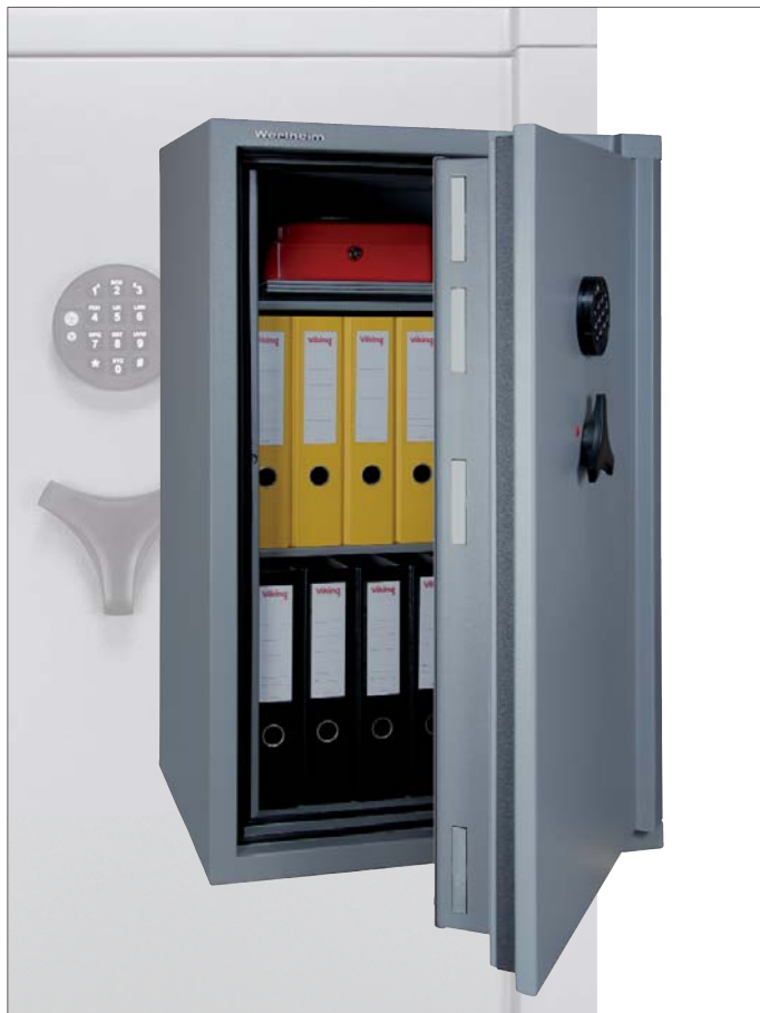
Fig. Safe CP25, hinge right E-Lock M-Locks EM3520, 2 shelves