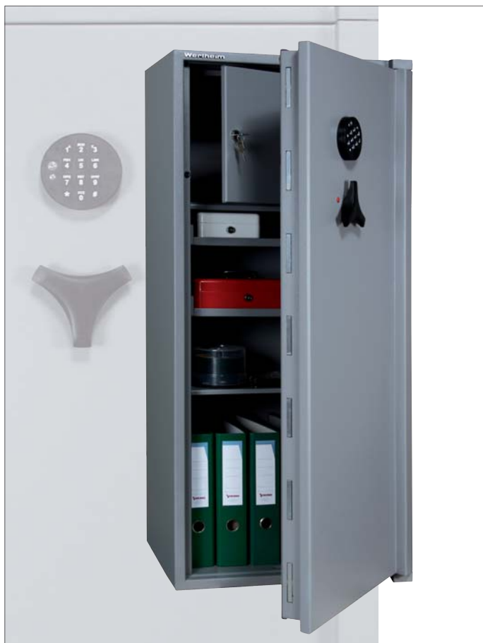
Fig. Safe BM35, hinge right E-Lock M-Locks EM3520, 1 inside locker, 2 pull-out shelves, 1 shelf